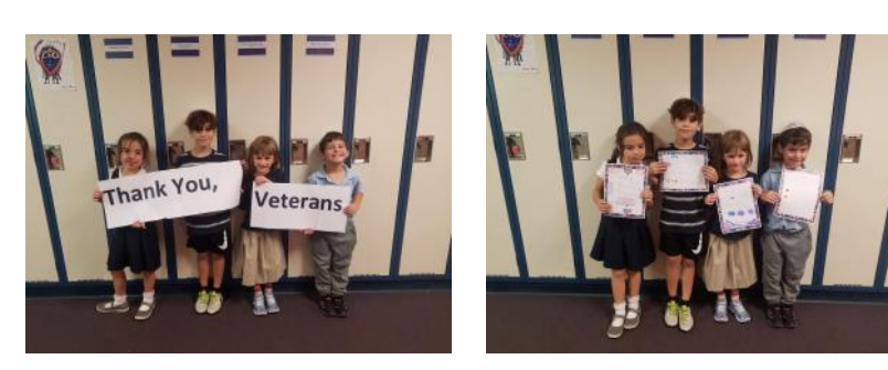
We made Veterans Day cards.