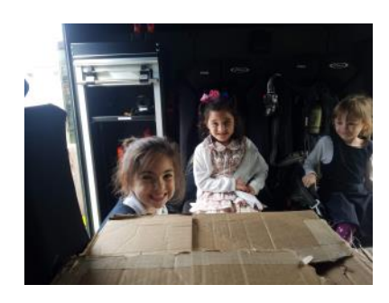
We saw the inside of a firetruck.