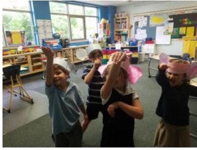
We made listening ears.